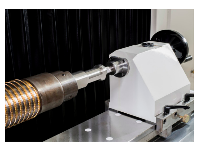
Standard screw actuated tailstock allows for the precise work between centers. Rail mounted, the tailstock can be easily moved to accommodate different setup lengths.