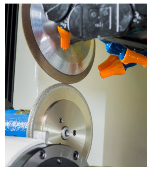
The wheel truing cycle is programmed into the machine. Simply enter the amount of stock removal and the machine automates the cycle.