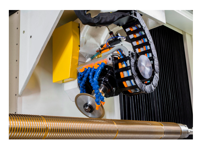
6-Axis design allows for (3) rotary motions and (3) linear motions and are simultaneously controlled allowing for the manufacturing and re-sharpening to today's most demanding designs.