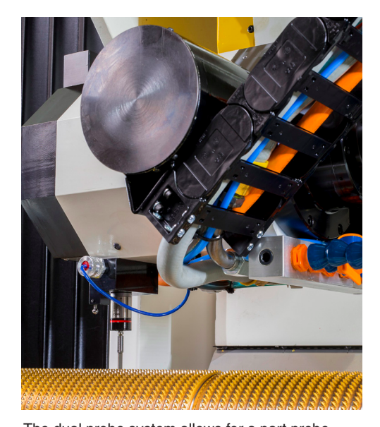
The dual probe system allows for a part probe to locate the cutting edges of the workpiece and reference it to the machine while the wheel probe (shown) locates the grinding wheel relative to the workpiece.